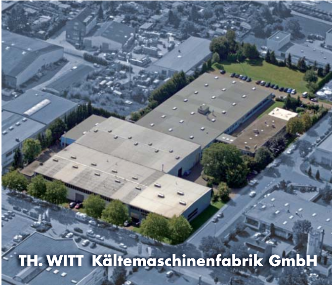
TH. WITT Kältemaschinenfabrik GmbH